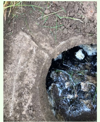
Cracked septic tank

Sewage disposal systems located less than 50 feet to a drinking water well or surface water. A minimum of 50 feet is the established standard to ensure bacteria and viruses are killed before they can contaminate our water.