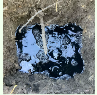
Sewage surfacing at end of drainfield

Homes with sewage surfacing, backing up, damaged septic tank, laundry or kitchen waste discharging on the ground surface.